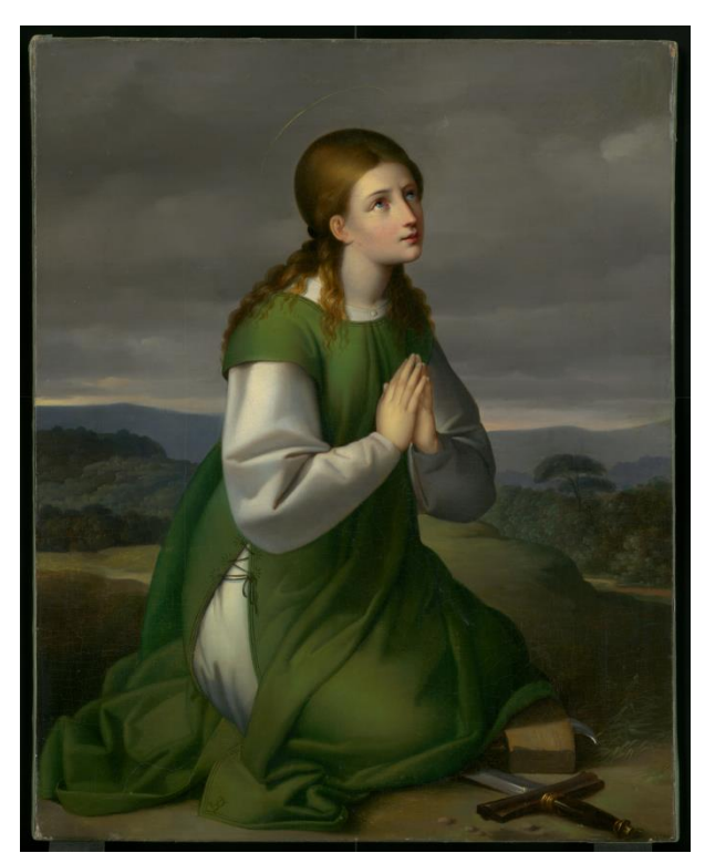
2 Johann Scheffer von Leonhardshoff, St. Catherine, around 1822, Oil on canvas (Slovenské národné múzeum – Múzeum Bojnice), Image: Digitálne múzeum

The main figures in the late Nazarenes movement in Vienna were Josef von Führich (1800 – 1876) and Leopold Kupelwieser (1796 – 1862).<sup>7</sup> Both were active also in the Hungarian part of the Monarchy. From the 1840s, Führich and Kupelwieser, both living in Vienna, were considered a great influence on religious painting. For example, in 1844 – 1846, Führich completed a large cycle of the