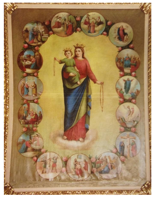
6 Jozef Božetech Klemens, Our Lady of a Rosary, 1870s, Oil on canvas, Church in Tvrdošín

Klemens like Švestka worked not only as painter but also an author of interior decoration. There exists a drawing for the whole set of altar architecture for the church in Žilina that provides a nice example of Klemens great range not only as a painter but also as interior designer. In the 1870s Klemens created several preparatory drawings with the motif of Our Lady of the Rosary. (Fig. 6) He produced a similar composition for the church in Raková and also for the church in Turzovka, with medallions inspired by popular compositions he created based on the old masters. A similar thread can be traced in the work of Konrad Švestka.