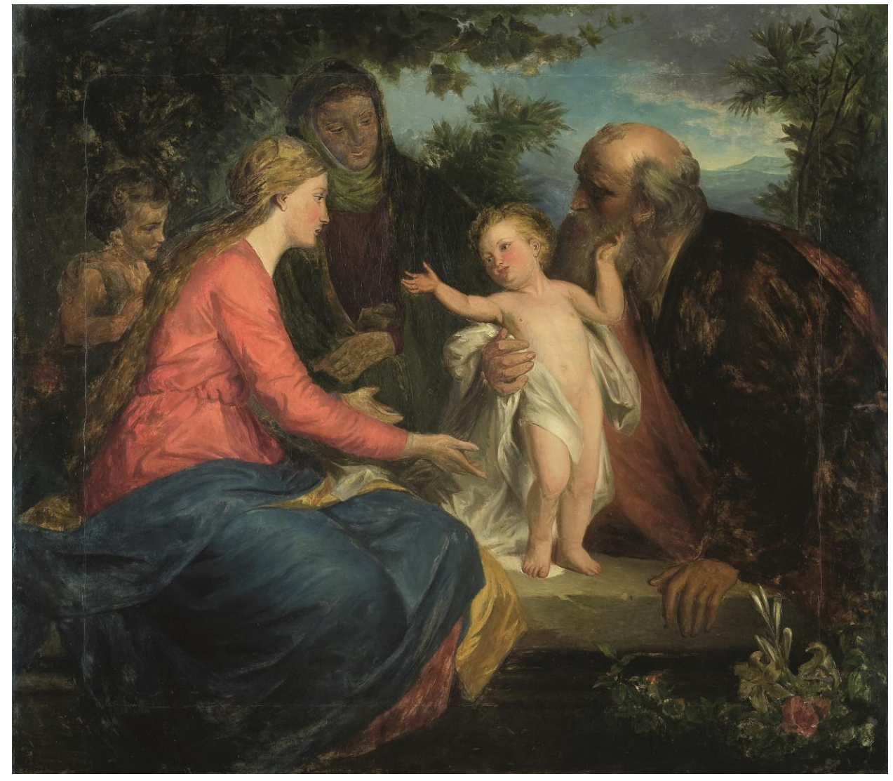
1 Josef von Führich, Holy Family, around 1850, Oil on canvas (Galéria mesta Bratislavy, Bratislava)

These two artists focused on the area of Upper Hungary, which in the second half of the 19<sup>th</sup> century had strong ties to the Empire's capital, Vienna, and also, eventually, to Budapest, when it gained increased importance after the Austro-Hungarian Compromise of 1867.<sup>4</sup> This was a period when parts of the Empire were gradually rediscovering their national roots and religious art became an important tool for the development of national identity. For the area of Upper Hungary this involved the use of artistic references to "national" saints like St. Stephen King, St. Ladislaus or St. Elisabeth of Hungary,<sup>5</sup> or Ss. Cyril and Methodius.<sup>6</sup> In the 19<sup>th</sup> century, the latter two saints were associated with