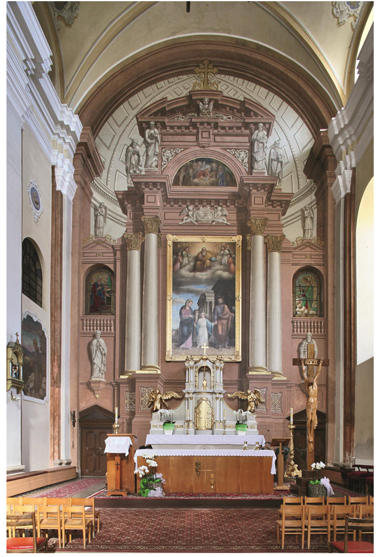
9 Konrád Švestka, Illusive painting, 1872, Franciscan Church in Prešov