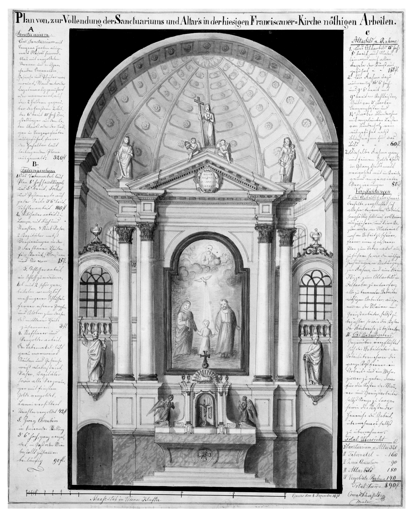
8 Konrád Švestka, Sketch for the interior of a Franciscan Church with detailed description of the proposal and prices, 1871, Drawing, paper, (Slovenská národná galéria, Bratislava)