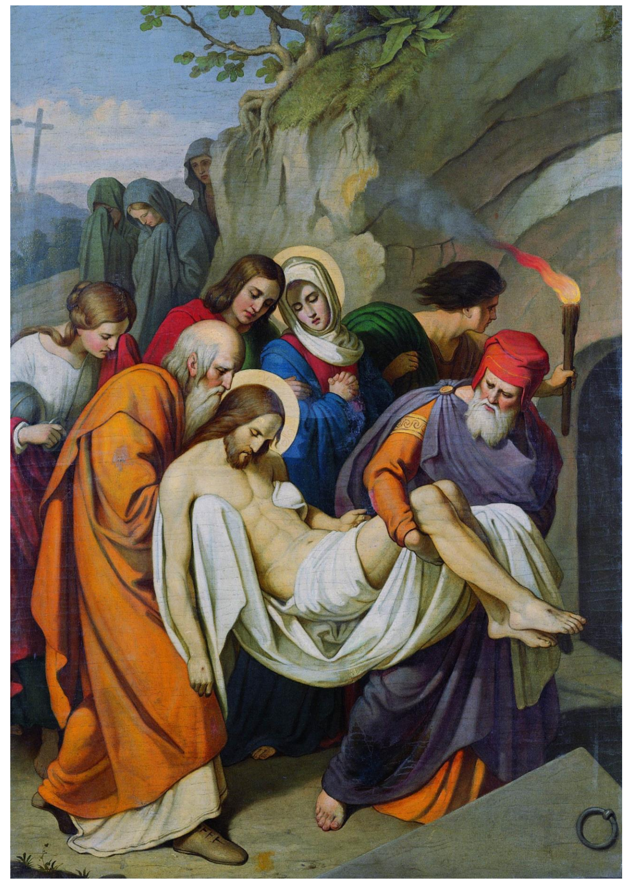
7 Joseph Führich, The Entombment, after 1834. Kroměříž, Collection of the Archbishopric of Olomouc, Archiepiscopal Castle and Gardens.