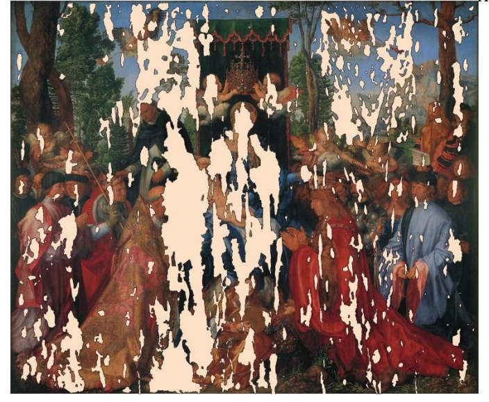
2 Albrecht Dürer, The Feast of the Rose Garlands, 1506: a photograph showing the degree of preservation: the white areas indicate where the original painting is missing.