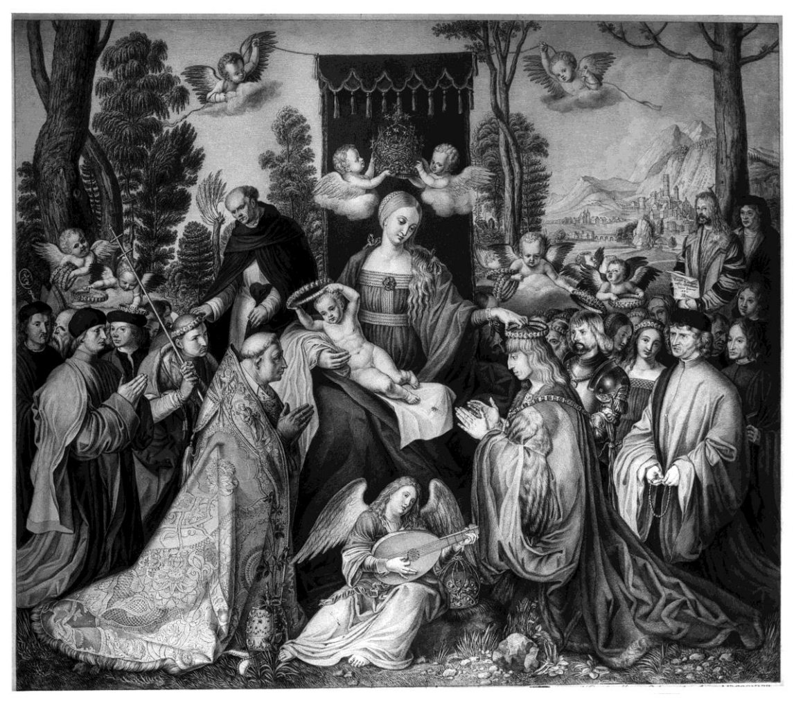
8 Václav Mánes after Albrecht Dürer, The Feast of the Rose Garlands, 1823, Prague, Academy of Fine Arts.

Gruss's possibly conscious omission of the fly could be understood with some lenience, as its presence in Mánes's drawing causes confusion even today. For example, in a full-page reproduction of a detail of the Virgin that was published in the journal Umění the fly is missing and was clearly simply touched out as a defect.<sup>28</sup> It is any surprise, therefore, that Gruss, a painter on the artistic periphery with no knowledge of art history or theory or of the scientific approaches to the renovation of art heritage did not understand this joke of Dürer's?