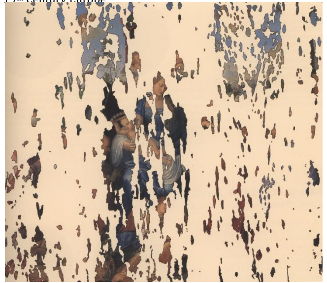
3 Albrecht Dürer, The Feast of the Rose Garlands, 1506: a photograph showing the degree of preservation: the white areas indicate where original Dürer's surviving painting.

(and partly also painted over); the areas of damage ran along the vertically joined planks of the support, especially in the middle, which means that the damage affected the central part of the scene