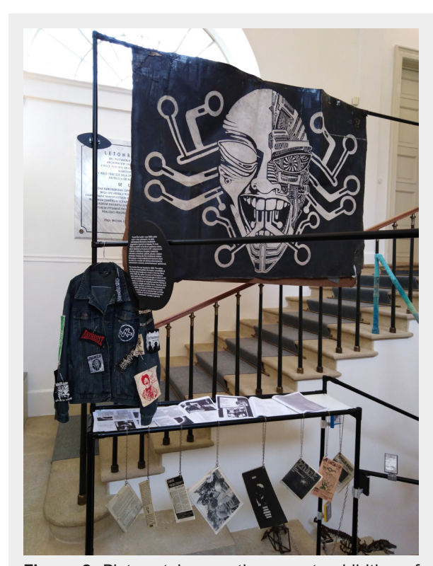
Figure 2. Picture taken on the recent exhibition of Ethnographic Museum of the National Museum in Prague, Czech Republic, dedicated to different faces of the Do It Yourself phenomenon.

widely used in popular music studies and was presented as a superior alternative to "subculture". It highlighted a contrast between local participatory practices and the dominant or mainstream culture. In the words of Barry Shank: "spectators become fans, fans become musicians, musicians are always already fans" and they create a productive environment for they activities. A scene itself was defined as an over-productive signifying community.<sup>13</sup>