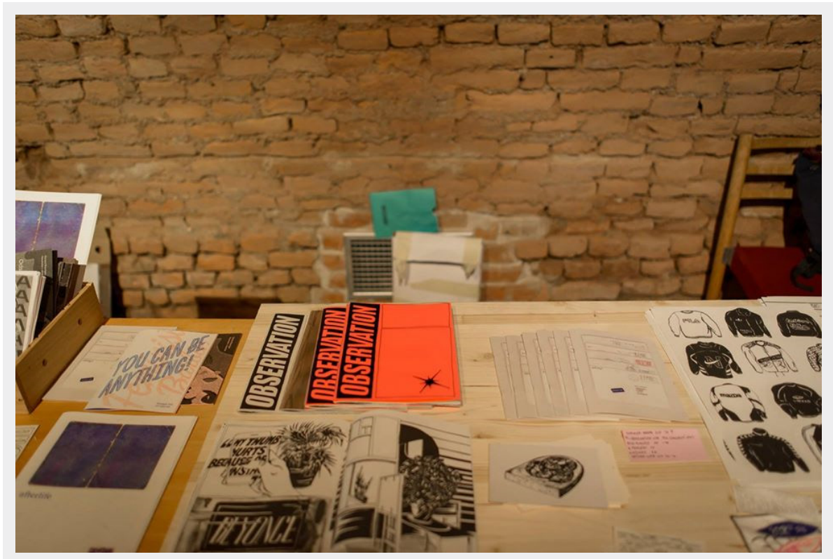
Figure 1. Fanzines for sale at zine fest organized in creative centre Kubik in Trnava, Slovakia.

In research on CEE history and in public debate, the role of alternative media and self-publishing has been basically overlooked by academia, with the exception of samizdat, which is presented as an important part of dissent heritage. There are probably several reasons why this is so, but we can generally observe a certain blindness to these historical sources because they are perceived as marginal activities with limited circulation and a negligible impact on general historical trends, i.e. the "Great Narratives" of the Iron Curtain and its fall. Even research on samizdat, whose role in the struggles against communist regimes was acknowledged as early as in the 1990s, did not develop significantly among academic scholars until the 2010s. However, in recent the alternative media - whether identified as "grassroots," "independent," "community," "participatory," "self-managed," "autonomous," "tactical," or "alternative" - has moved from the margins of political and academic debate to the centre. The emergence of the Internet in the late 1990s and new digital communication platforms in the 2000s played an important role in gaining alternative media more serious recognition, as they opened up new opportunities for self-expression and community building. In this respect the Internet started a new era of digital activism. However, alternative or non-institutionalized media channels have also enabled the expansive spreading of fake news and conspiracy theories in recent years.