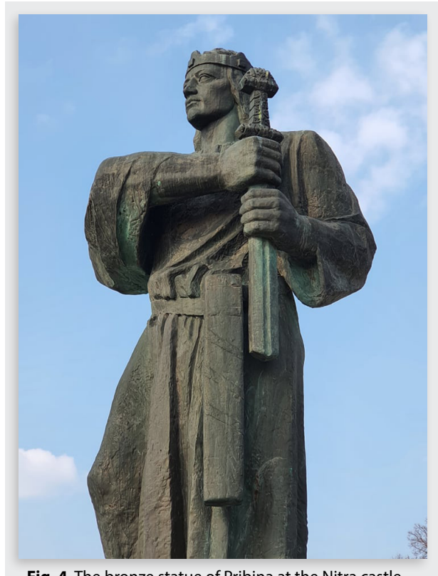
Fig. 4 The bronze statue of Pribina at the Nitra castle square, 1989, author Tibor Bártfay.

and "normalized" Czechoslovakia. Such an image was replicated exactly by the domestic national historiography.