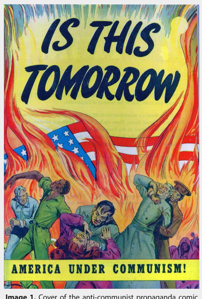
Image 1. Cover of the anti-communist propaganda comic book Is This Tomorrow.

One such anti-communist comic, published in 1947, is called Is This Tomorrow. America Under Communism!10