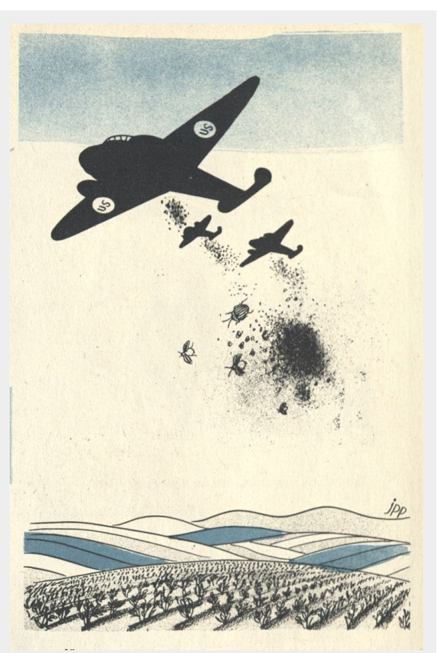
Image 4. US planes drop potato beetles over socialist fields. In Roháč 11 June 1950.

In addition to printed news, the scandal of the "American Beetle" was also communicated to the general public in Czechoslovakia through leaflets and documentary films. Aside from the illustrated agitprop for children, O zlém brouku bramborouku (1950)