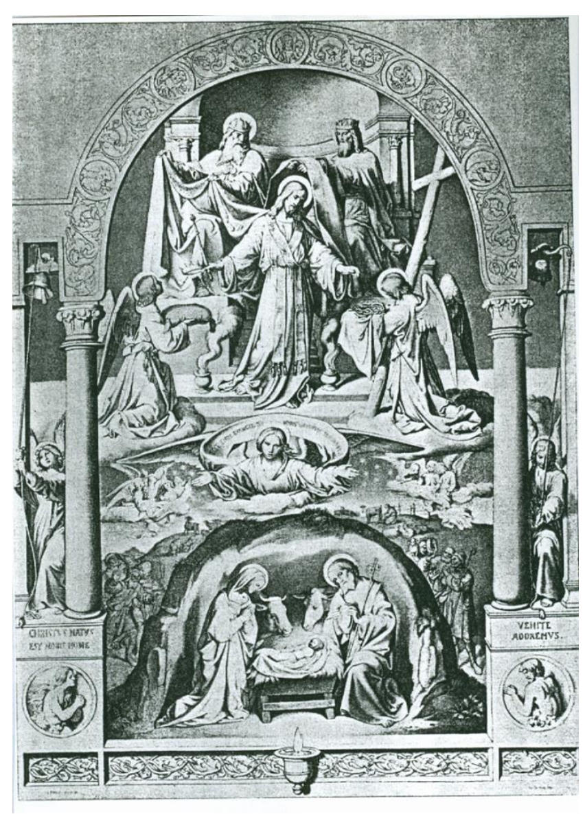
7 Führich, Die Menschwerdung Christi, 1838