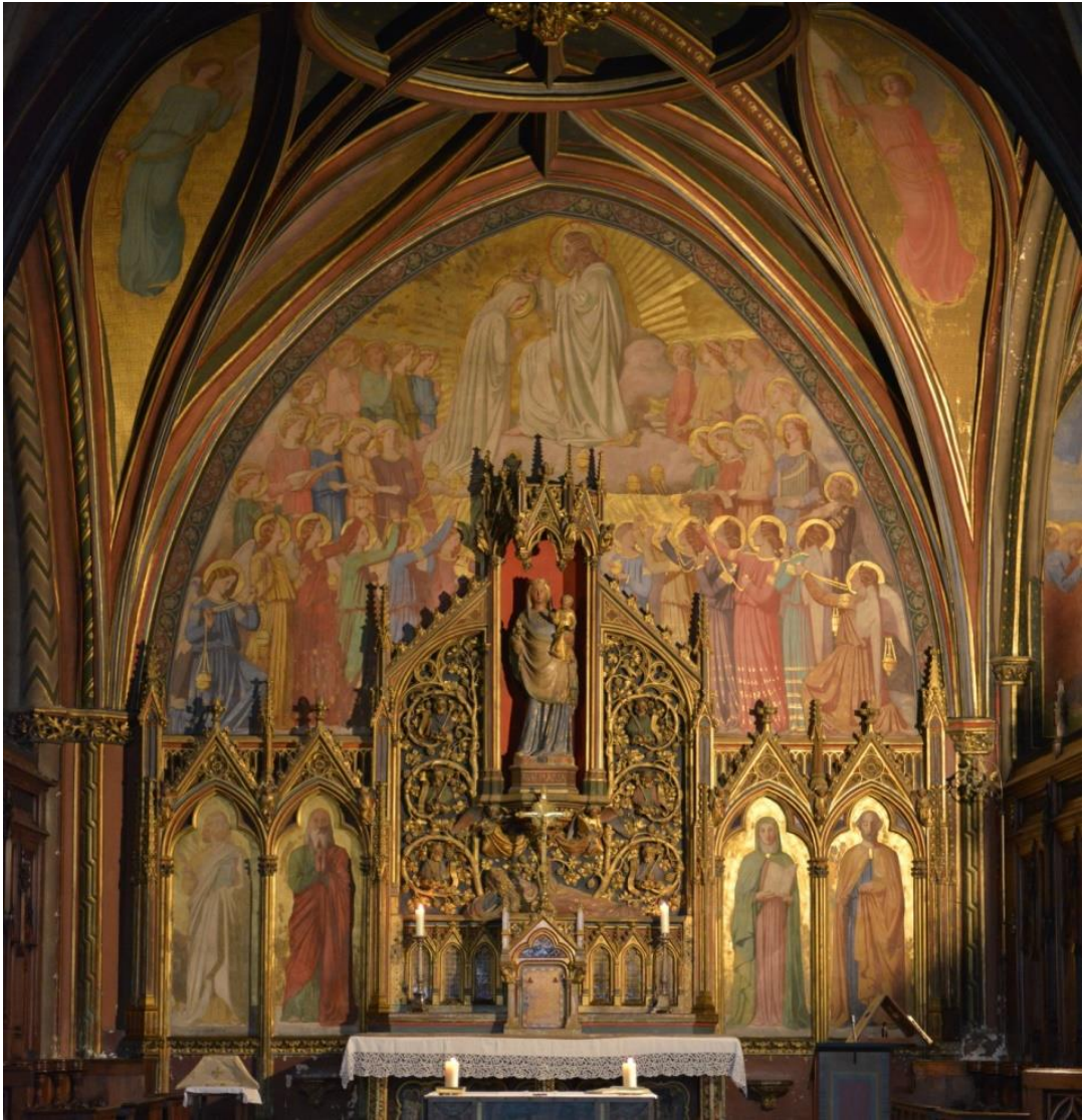
2 a,b Eugène Amaury-Duval (1808 – 1885), Coronation of the virgin, (full and detail) 1844 – 1845, Paris, Eglise Saint-Germain-l'-Auxerrois, chapelle de la Vierge.