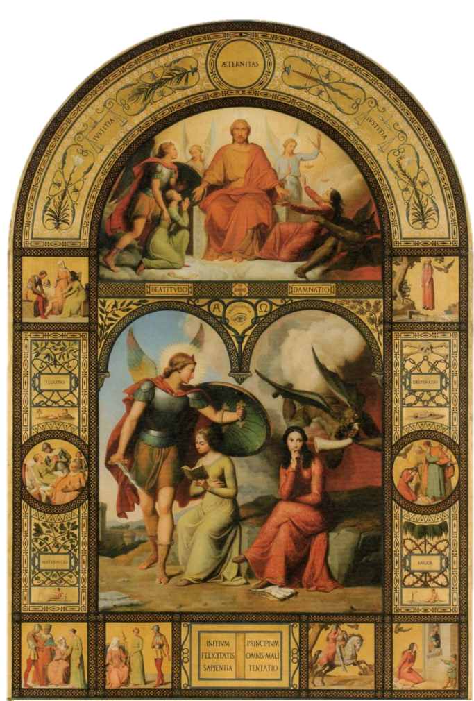
3 André-Jacques Victor Orsel, 1795 – 1850, Le Bien et le Mal, 1829 – 1832, musée des Beaux-Arts de Lyon

But the position of the other artists mentioned here was often less militant and sometimes more nuanced. The religious sentiment of Orsel, for instance, is quite complex as