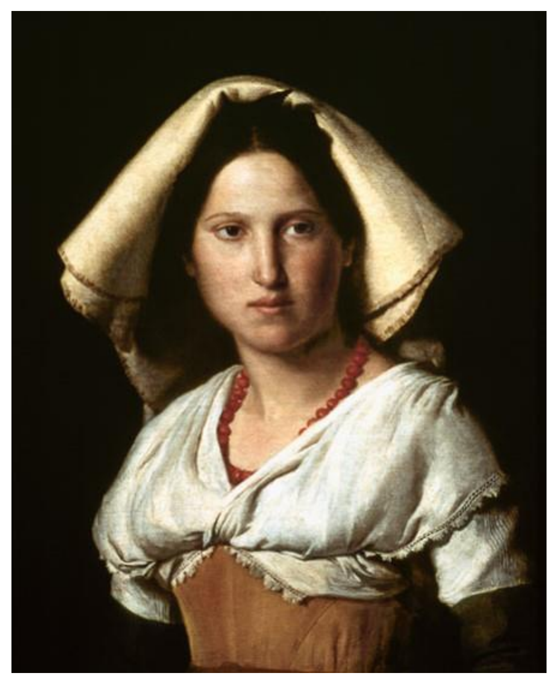
4 Victor Orsel (1795 – 1850) Portrait de jeune italienne (Vittoria Caldoni), vers 1825 – 1826, Huile sur toile - 63,5 x 50 cm, Lyon, Musée des Beaux-Arts

Interest in the Nazarenes could thus lead to very different stylistic interpretations. On the other hand, there is no doubt about the piety of Louis Joseph Hallez (1804 – 1882), who was indeed aligned with Overbeck. A prolific drawer, Hallez produced a large number of religious illustrations for the famous Catholic publisher Maison Mame.<sup>53</sup> (Tours). This leads us also to examine also the influence of etching.