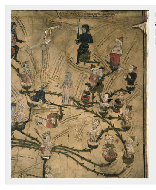
Figure 3: Genealogy of Edward IV (British Library, Harley 7353)

Previous scholarship repeatedly stressed the importance of the late 13th and early 14th century when the Habsburgs acquired a royal status and, unlike the neighbouring dynasties, continued to rule for many centuries to come.<sup>31</sup> Another decisive phase came in the 15th and early 16th century, when a functional system of marriage connections and inheritance treaties gave the dynasty one ruling title after another, without having to fight for it much. As a matter of fact, the Habsburgs came